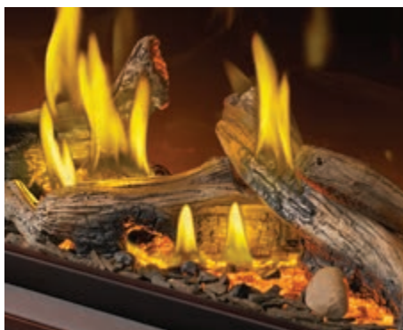
Driftwood logs with woodland kit