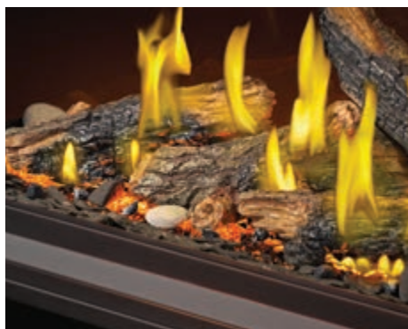
Oak logs with woodland kit