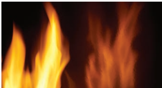
MIRRO-FLAME ® porcelain reflective radiant panels included