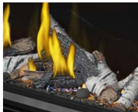
Birch logs with woodland media kit