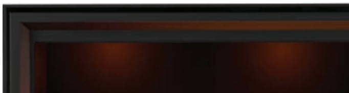
Adjustable finishing flange for modern frameless appearance