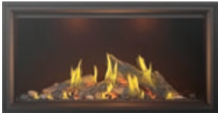
Tall Vector with Luminous Logs