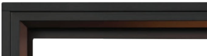
Adjustable 4pc 5/8" finishing trim for installations that require more coverage