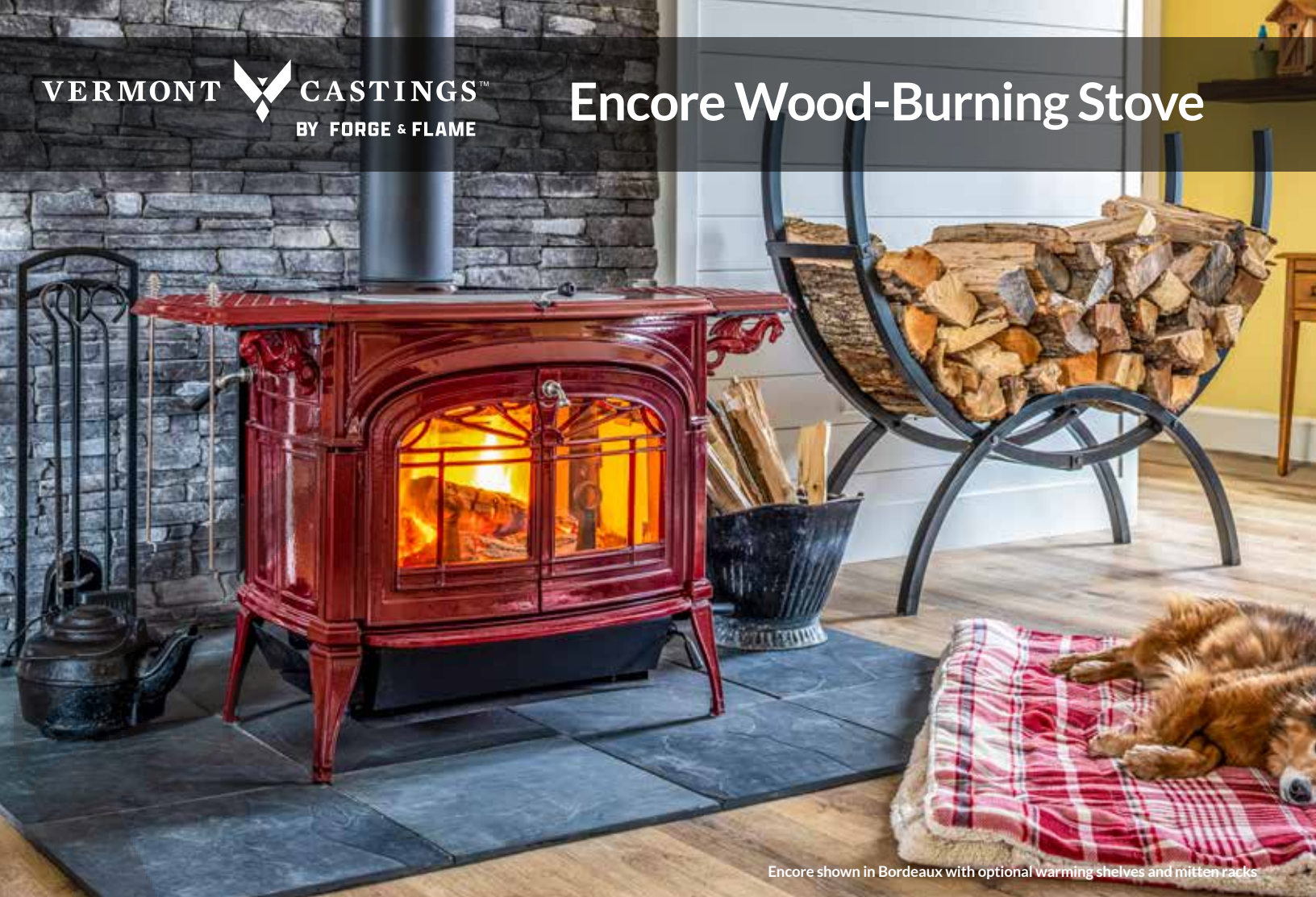
Encore shown in Bordeaux with optional warming shelves and mitten racks