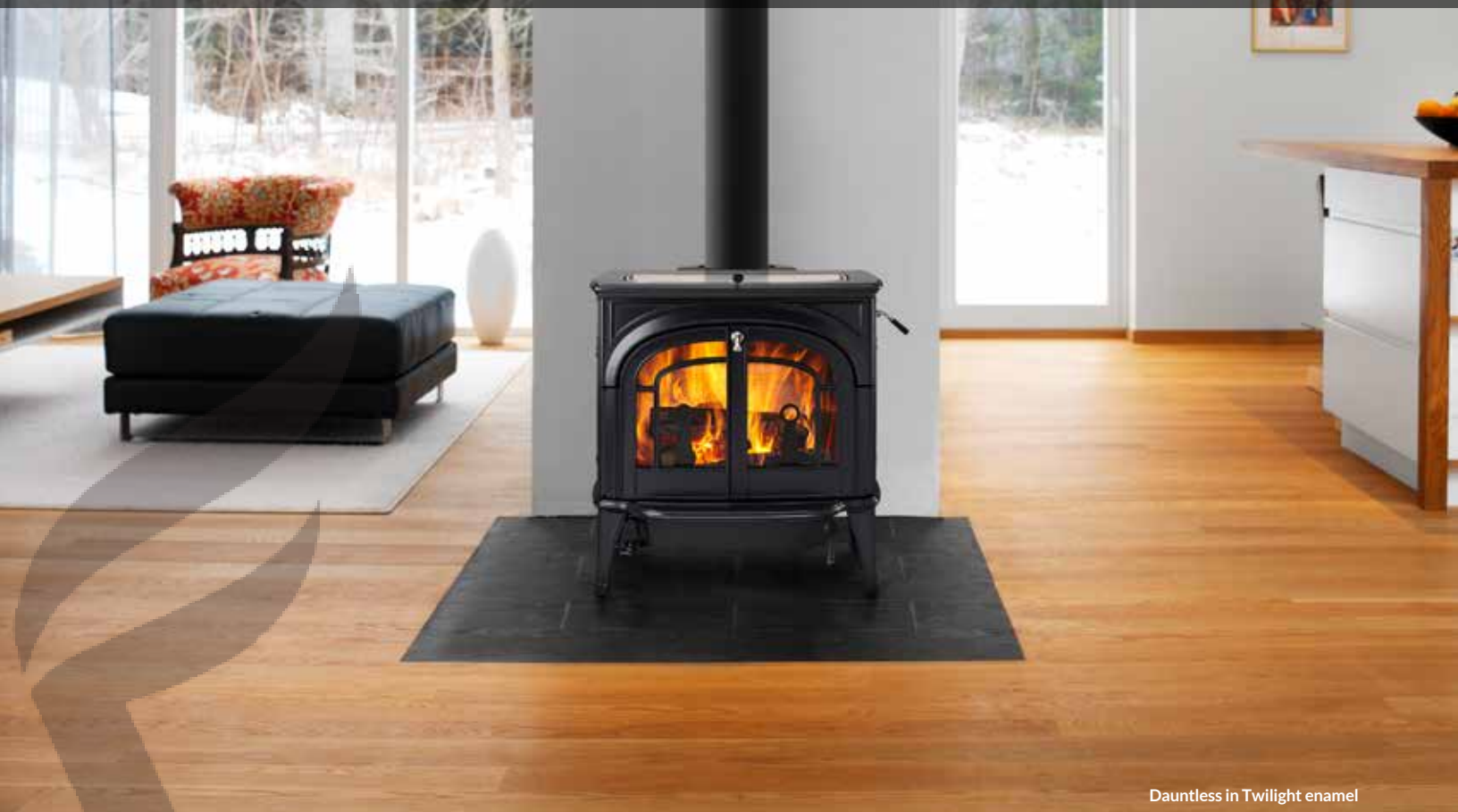
Dauntless in Twilight enamel